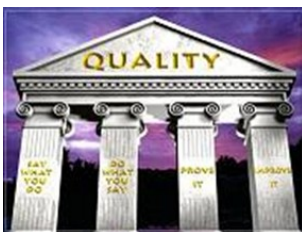
Pakaflex's Quality Philosophy

Pakaflex is committed to continuous improvement and meeting the standards of AS/NZS ISO9001:2008. Whether we make the product or not, we support the products we supply. In 2006 we installed a state of the art computer system for full batch and raw material product traceability; in 2011 this was expanded to include product and corrective action resolution.