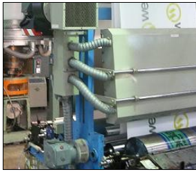
Pakaflex in-line printing equipment

“Pakaflex is committed to delivering Affordable Quality to our customers”