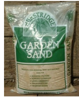
Pakaflex Sand and Soil Bags are strong and can have four colour print