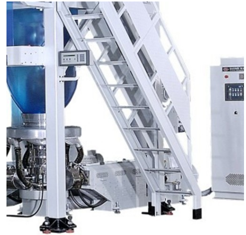
A Pakaflex ‘bubble’ extrusion unit

By manufacturing in Melbourne, Pakaflex can do short runs and configure products for customers much more dynamically than our regional competitors and imported products. Pakaflex has configured to do these jobs in the most cost effective way possible ensuring we can deliver our promise of ‘Affordable Quality’ with superior service and support. Our core production competencies are in film extrusion with simultaneous (in-line) printing. Hence we are able to supply high quality films with multi-sided and coloured print for industrial applications very competitively. In 2011 Pakaflex installed post-printing gusseting, which means that polymer, additive, mulch, insulation and other bags can have print in the gusseted area at no extra cost. The new extruder in 2012 will bring our plant capacity to well over 2,000 tonnes per annum. Our capability goes from 100mm tubing through to 2300mm printed single sheet with a variety of films substrates including PE, PP and multi-layer co-extrusions.