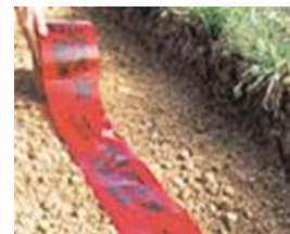
Pakaflex manufactures AS/NZS standard underground warning tapes in Melbourne.