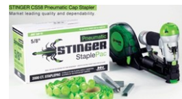
Pakaflex supplies Stinger staple caps to the timber industry

“Our experience in UV additives makes us the logical choice for long-life outdoor products”.